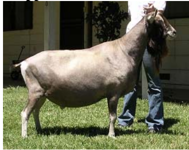
Note: carries black genetics