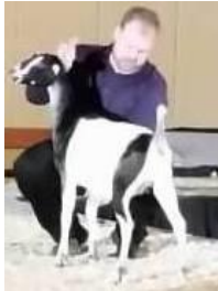
Mint*Leaf Savvy