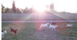
Intermediate II Division Submitted by Kira B.